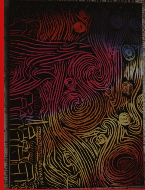
Hajira Bee - 22 CDSA21