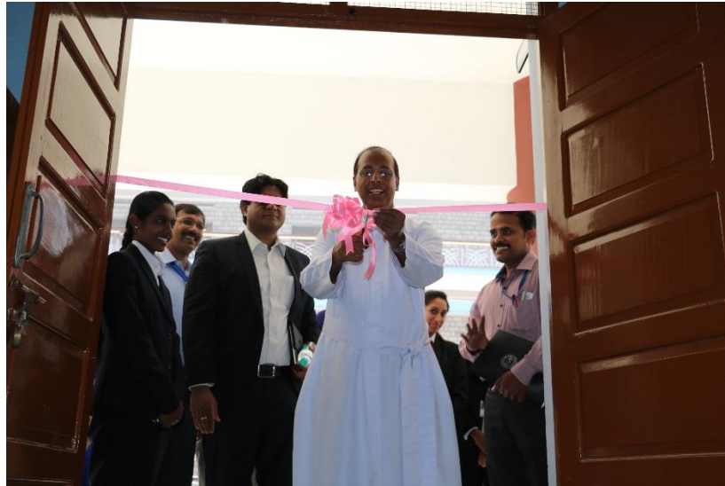
Inauguration by Fr. Principal