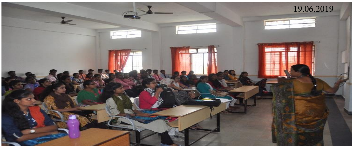
Life Skill Education – A Session on Coping with Emotions