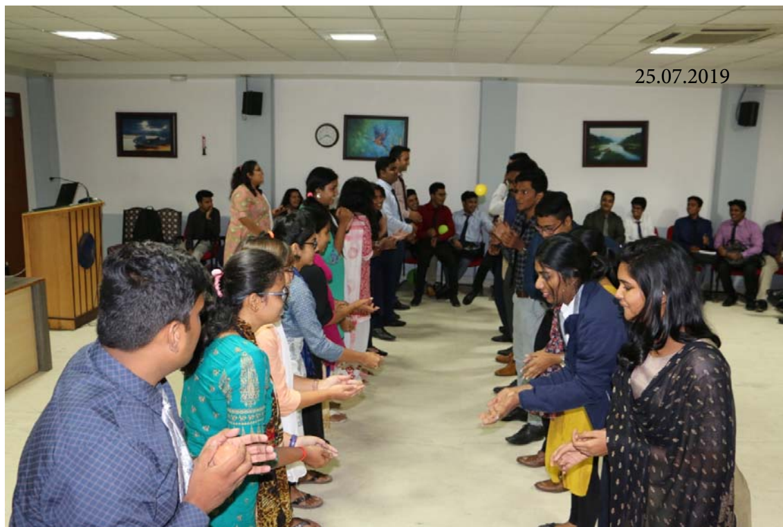
Students engaged in the activity