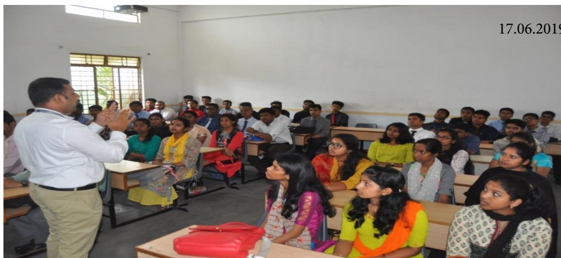
Life Skill Education – A Session on Self-Awareness