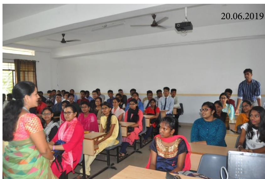
Life Skill Education – A Session on Problem solving