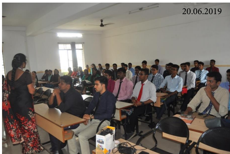
Life Skill Education – A Session on Empathy

We thank all the teachers for training us on life skills which benefited all of us to a greater level. We humbly thank Kristu Jayanti College for organising the training of life skills education.