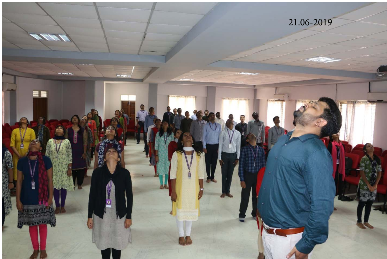
Students during the Yoga Session