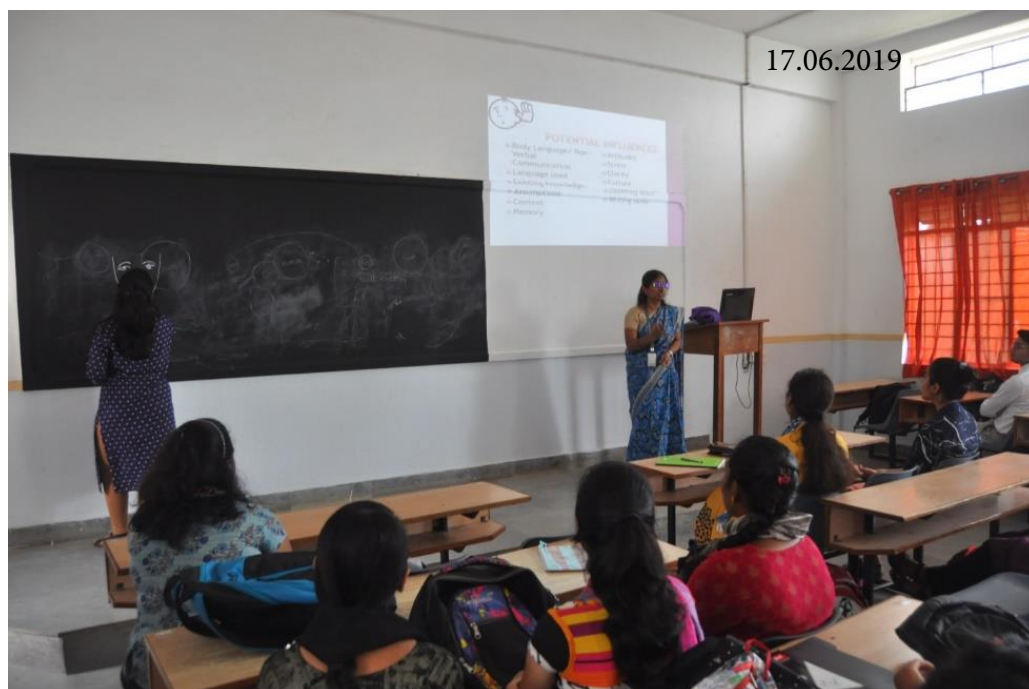
Life Skill Education – A Session on Creative Thinking