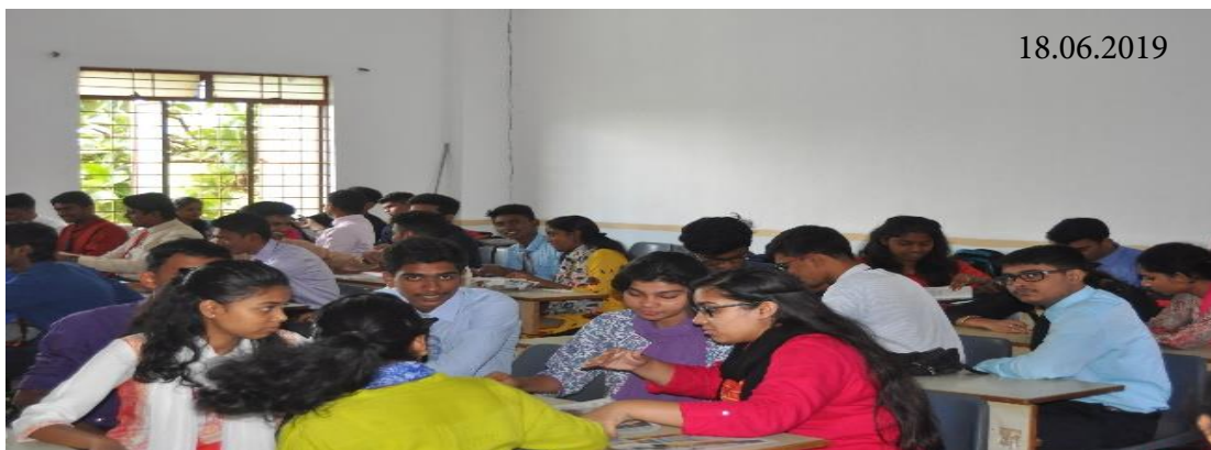
BBA I Sem students participating in the activities of Life skills training.