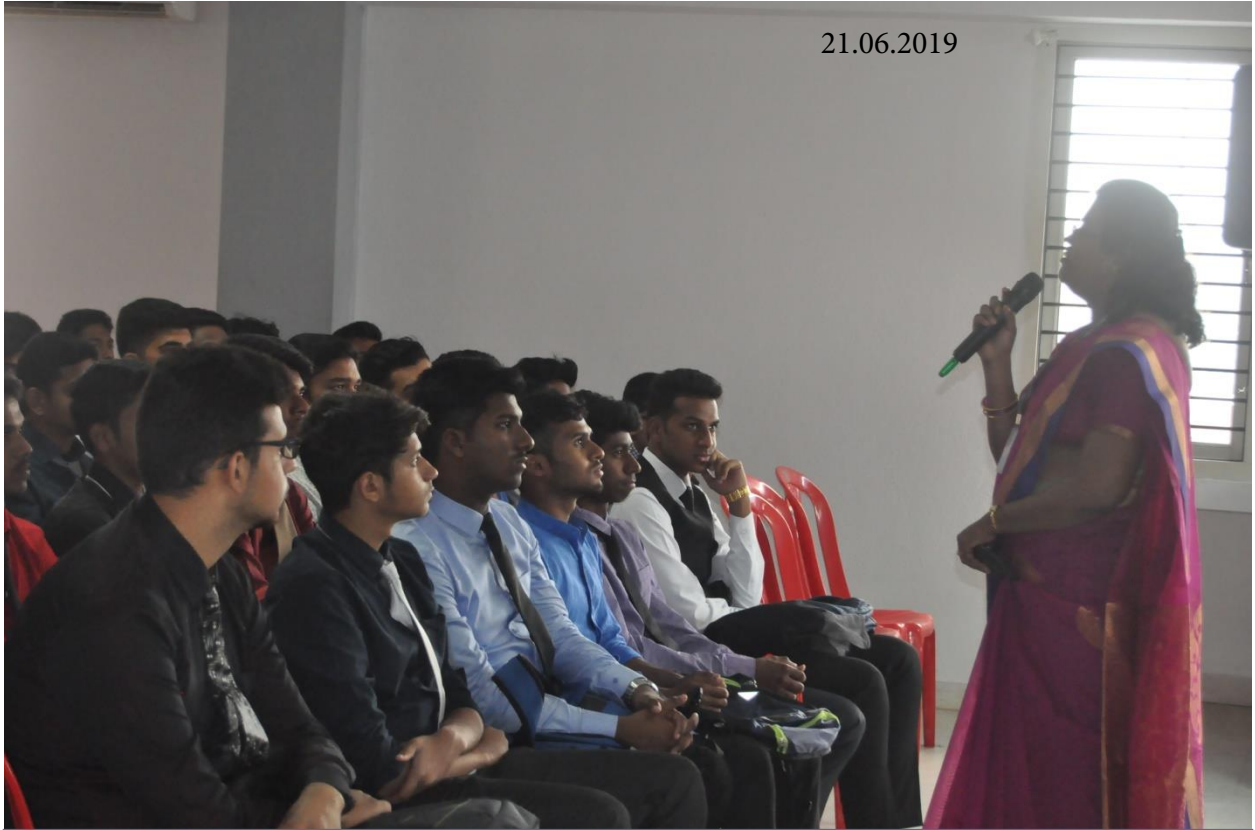
Life Skill Education – A Session on Coping with Stress