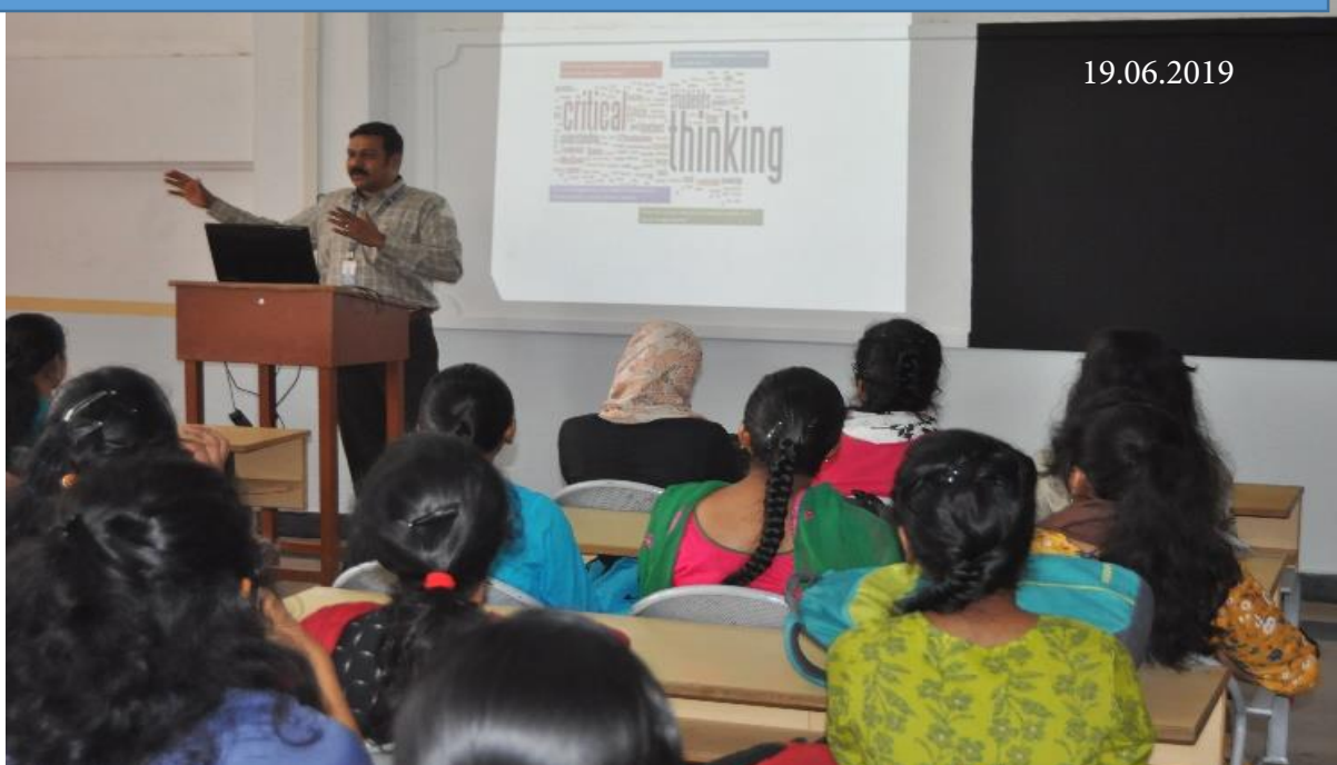
Life Skill Education – A Session on Stress Management