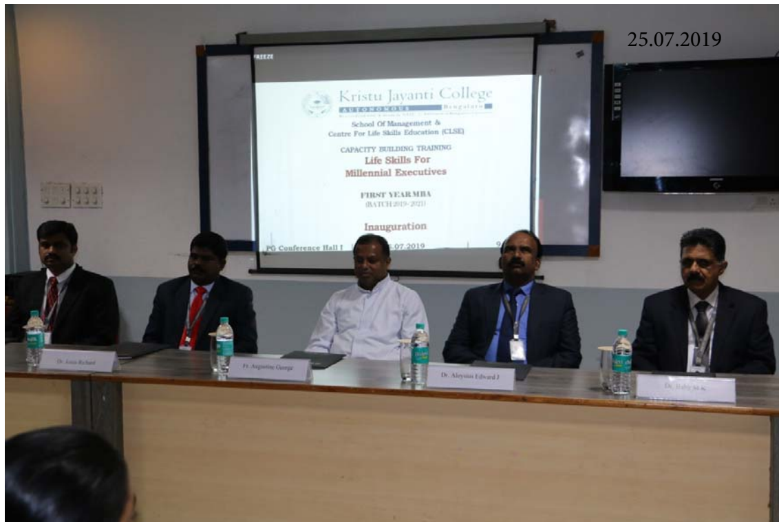
Inauguration of the programme