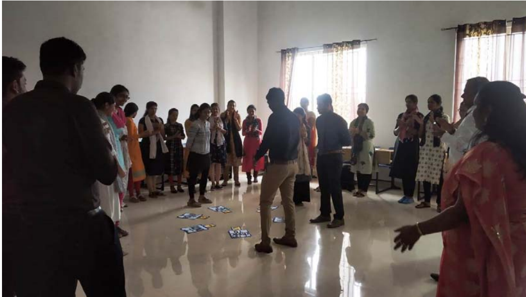
Activity carried out by the students