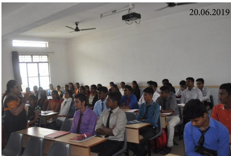
Life Skill Education – A Session on IPR