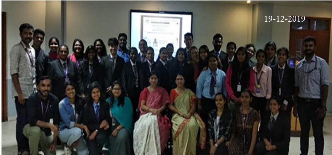
Participants with the resource person after the session