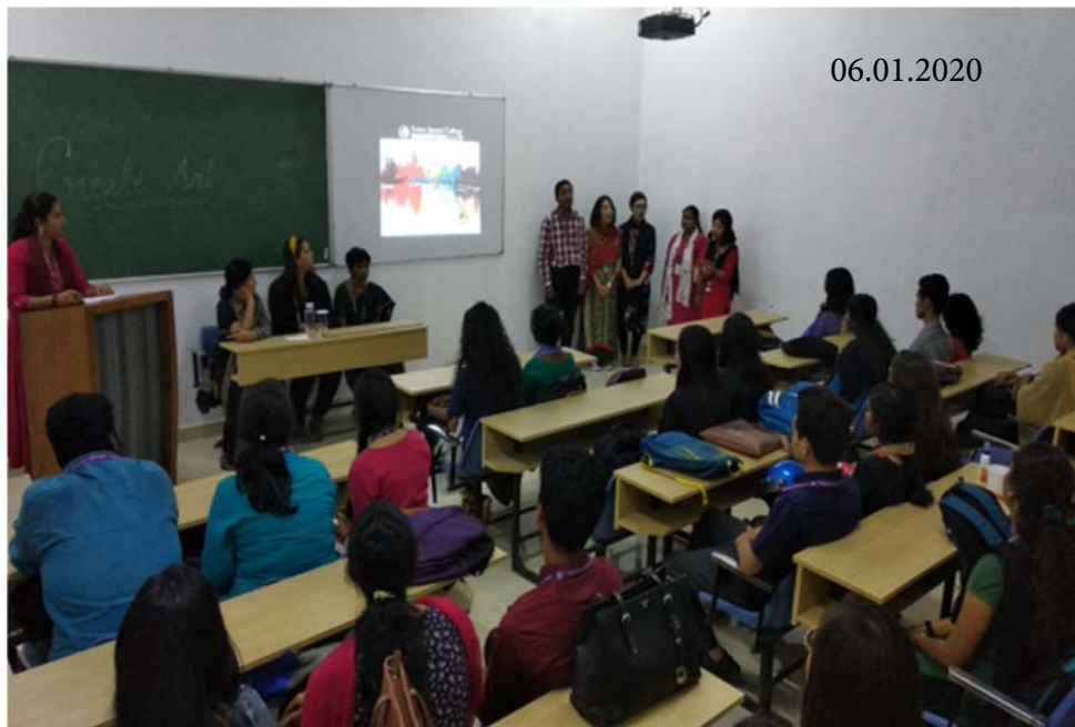
The formal session of the workshop.

organized. As an arts student, it was an eye opener for me to realise that anyone can create art and how to channelize one's creativity in the right way. The resource person who herself is an artist cum art curator held my undivided attention throughout the session with her captivating ideas.”