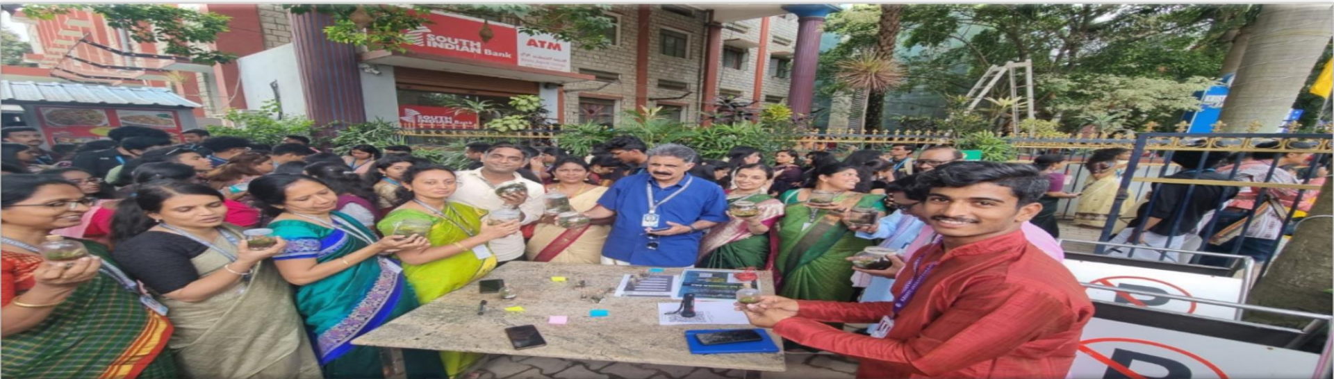
Faculties are visiting E-Store Stalls and supporting the young Entrepreneurs