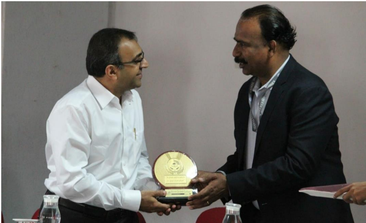
Dean, Department of Commerce & Management presenting memento to chief guest as a token of appreciation