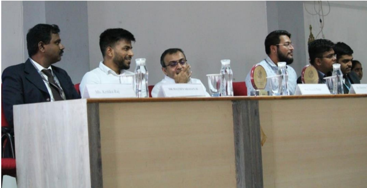
Diagonitories on the Dias