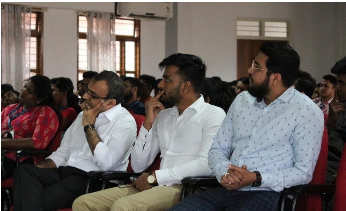
Guest listenting to EIC student member queries