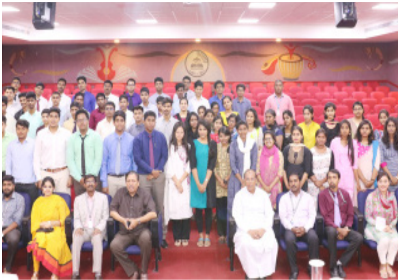
Justice Santosh Hegde with students

“We live in a society that respects money and power, over the pure and simple trait of honesty,” said Hon. Justice Santosh Hegde, Former Judge of the Supreme Court of India, during an interactive session with the Law College students held on 1 August, 2017 in Kristu Jayanti College. The session was organized by the College of Law to provide the students an opportunity to have an industry exposure and network with the professionals. The Chief Guest, Justice Hegde emphasized on the society at present being power and wealth driven, as the competition is to either be rich or have power. “I was a frog in the well; I didn’t know the sufferings of the people even though I was under an institution representing the constitution, the government,” added Justice Hegde, regretfully as he educated the students about all the evil perils happening in the society. Furthermore, he