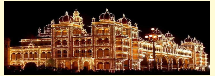
The crown jewel of Mysore's architectural legacy.

The highlight festival is as always, the illumination of the entire city turning it into a magical wonderland. Notable heritage buildings like the Mysore Palace, MCC Office, City Railway Station and others were also magnificently lit up. The Mysore Palace is an eye-catching spectacle decorated brightly with approximately 100,000 light bulbs. These lights