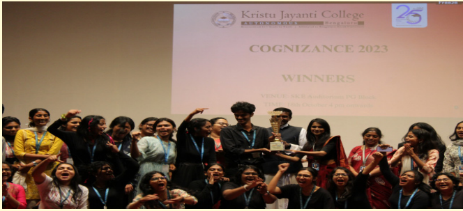
Students of Third year PyEng- proud and roaring with joy as they bagged the prize of Cognizance 23.