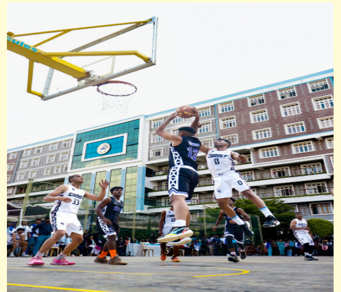
Jantian Cup: where passion meets the hardwood

The second day of the tournament saw teams battling it out on the court, with only two teams, KJC and Christ Central, crossing the 50-point threshold on the first day. The semi-finals witnessed Kristu Jayanti College (KJC) triumph over Christ Kengeri, while Mount Carmel College (MCC) girls outperformed their opponents from