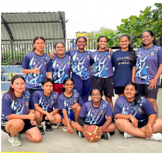
Rising Courtside Queens: Girls' Basketball Showdown at Kridotsava, Kristu Jayanti College!

Bangalore, October 17, 2023 - The annual Kridotsava Games at Kristu Jayanti College Campus roared to life as eight department-based teams clashed on the basket