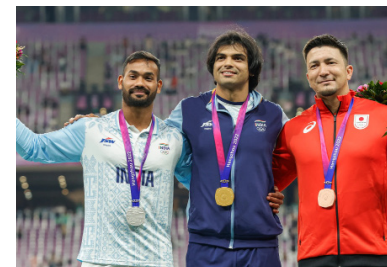
Neeraj Chopra-led Indian contingent aims for 25 medals in athletics