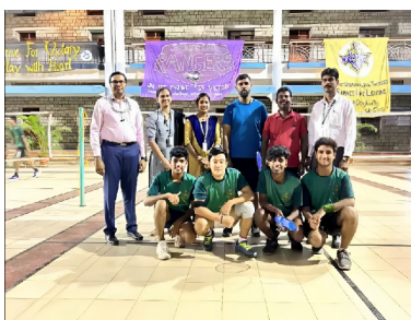
"Shuttle to Victory: Badminton Tournament at Kridotsava, Kristu Jayanti College!"

rivalry and their strong feeling of friendship. Students, faculties, and staff from all departments came together to support their respective Jayantian teams, igniting the crowd at