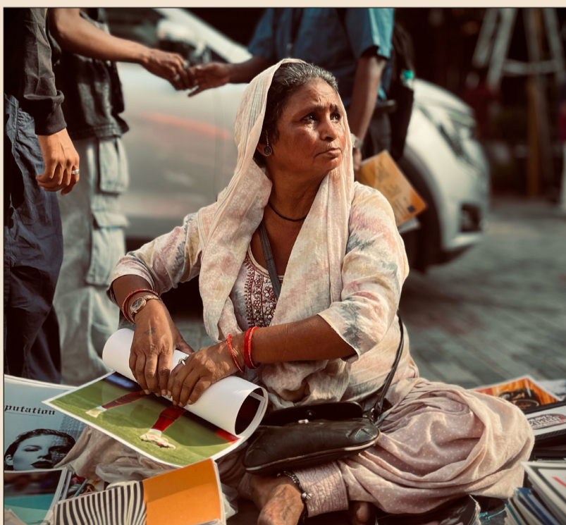
You will find that cruelty and benevolence are shades of the same color