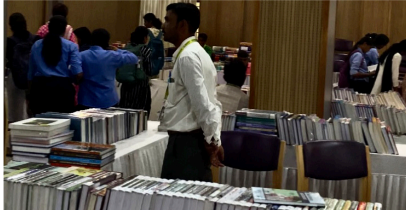
Hall of Knowledge: Where every book opens a new world