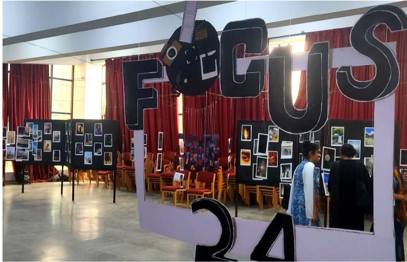
Captured moments, timeless stories and a glimpse through the lens