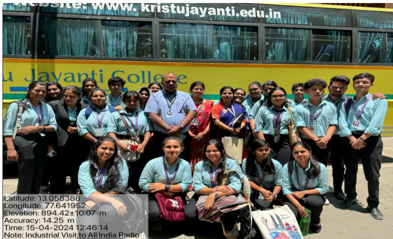
Latitude: 13.058388 Longitude: 77.641952 Elevation: 894.42±10.07 m Accuracy: 14.25 m Time: 15-04-2024 12:46:14 Note: Industrial Visit to All India Radio