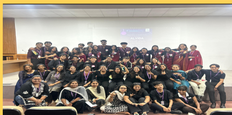
Juniors bidding farewell to their seniors