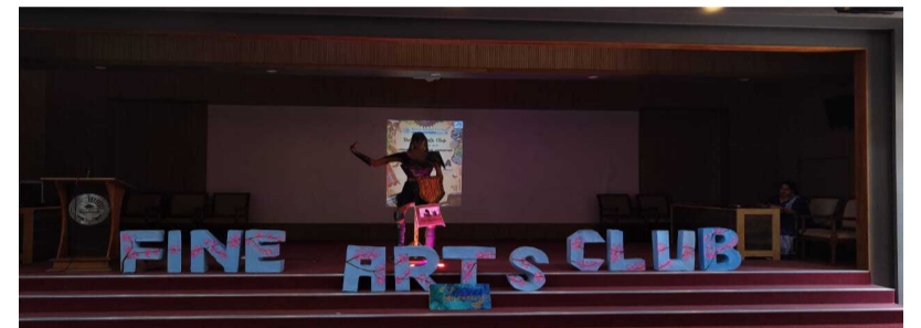
Fine Arts Club organizes Shilpkala