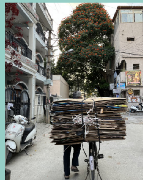
The weight of a lifetime's worth of toil etched into his weary frame Moasunep Pongen