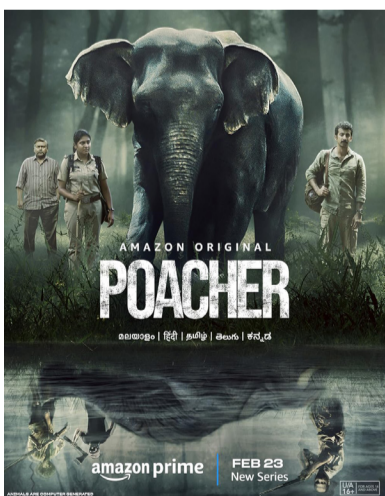
Survival of the Fittest : Poacher