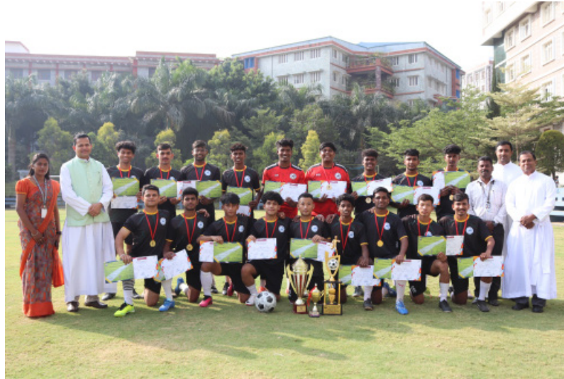
The football team, accompanied by faculty and management members.