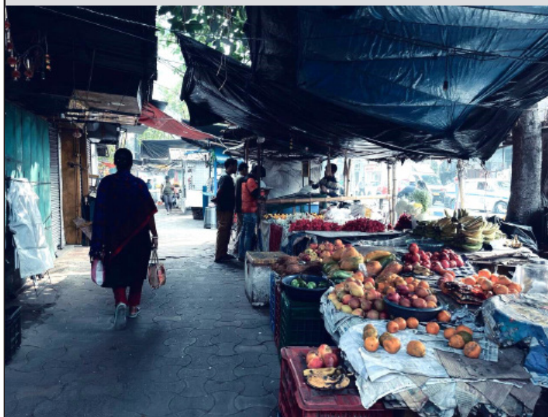
Life and colour converge in the streets of Calcutta