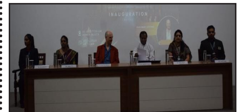
Kristu Jayanti College hosts Invictus 2nd edition