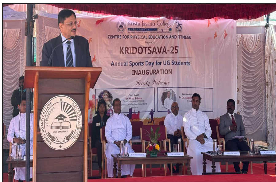
Building leaders through sports and unity

Kridotsava 2025 not only celebrated athletic excellence but also underscored