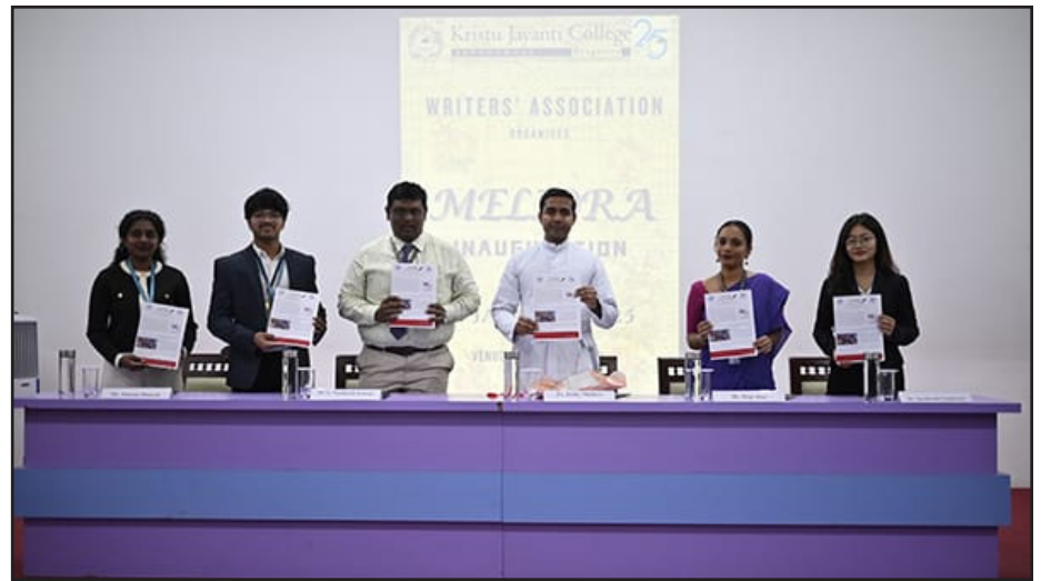
Kristu Jayanti College hosts Meliora, a vibrant literary fest

The Writers Association of Kristu Jayanti College, Bengaluru, hosted its vibrant intra-collegiate literary fest, Meliora, on January 16th, 2025. The event, marked by enthusiasm and fervor, attracted the participation of 168 students from various disciplines, all eager to showcase their literary and creative talents.