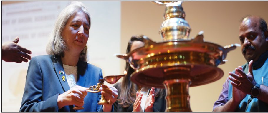
Kristu Jayanti College Observes Holocaust Remembrance Day, Promoting Peace and Awareness

On January 27, 2025, the Holocaust Remembrance Day was organized by The Consulate General of Israel, in collaboration with Kristu Jayanti College, Bengaluru. The event aimed to educate and reflect on the historical significance of the Holocaust and its global impact.