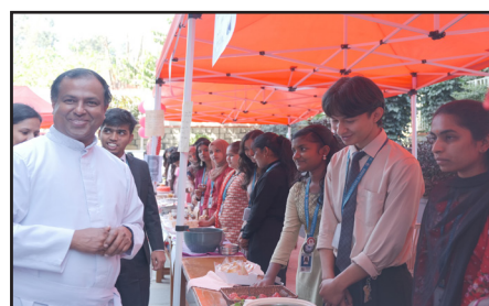
Kristu Jayanti College hosts a literary food fest

the Grims and Gothic stall, drawing inspiration from Dracula, and Melt and Whisk, which offered unique chocolate delicacies. The event was a resounding success, fostering creativity, teamwork, and cultural appreciation. It provided students with a platform to showcase their artistic and culinary talents while emphasizing the deep connections between literature, art, and food. Ultimately, Palatum Litterarum was a celebration of imagination and collaboration, leaving attendees with lasting memories and a newfound appreciation for the literary and culinary arts.