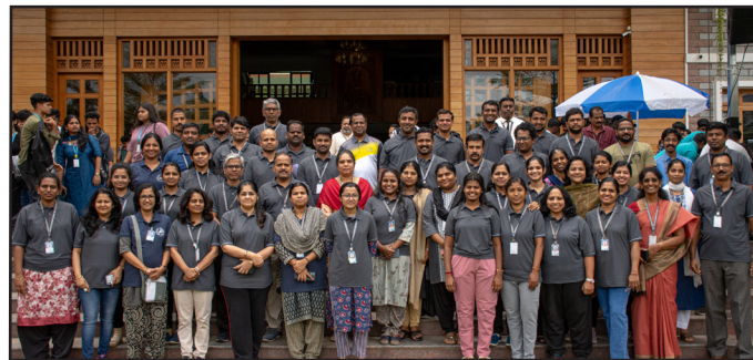
When teaching meets teamwork on the field