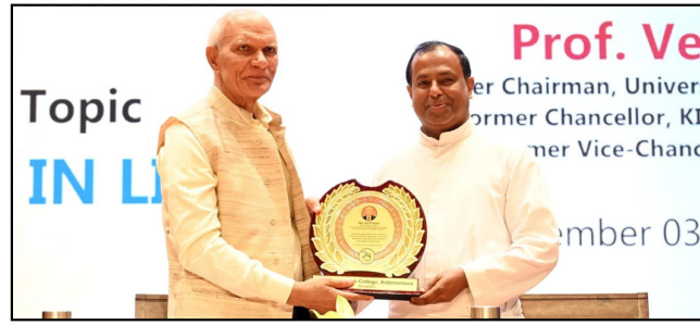
Success hinges on lifelong learning, dreaming big, and resilience.