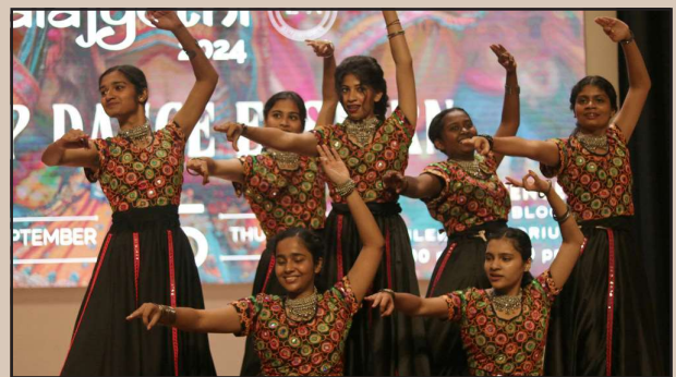
Kalajyothi dancers celebrate 'Indian Ethos and Heritage'.

The theme for this year's Kalajyothi is 'Indian Ethos and Heritage' with various literary, art and cultural events lined up over the span of seven days, with the finals scheduled on September 5, 2024. With over 1000 participants from all the departments participating in competitions ranging from salad making, skits, elocution to singing, photography and dancing, Kalajyothi has been successful in providing the students with an opportunity to bring their talents in the limelight.