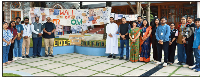
Kristu Jayanti College inaugurated the "Wall of Freedom" to honour journalists of India's Independence.

Kristu Jayanti College marked the spirit of the 78th Independence Day with the inauguration of the 'Wall of Freedom' on August 16, an initiative by the Department of Media Studies in collaboration with the Journalism Club. The event was designed to honour journalists who played a pivotal role in both the pre-independence and post-independence eras, ensuring that the voice of resistance