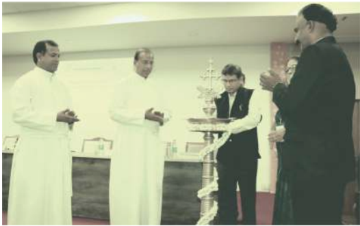
All India Educators Meet: Enhancing Learning Experience Through ICT