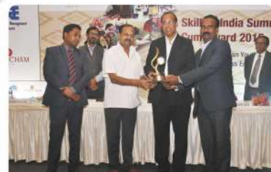
Kristu Jayanti College received Best College for Innovation by ASSOCHAM in August, 2015.