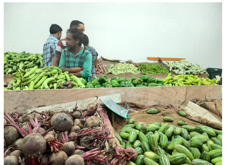
Vegetable Market in Ram Nagar

As the climate is moist due to which vegetables spoil quickly mostly leafy vegetables spoil quickly and they are in condition which we cannot buy said by