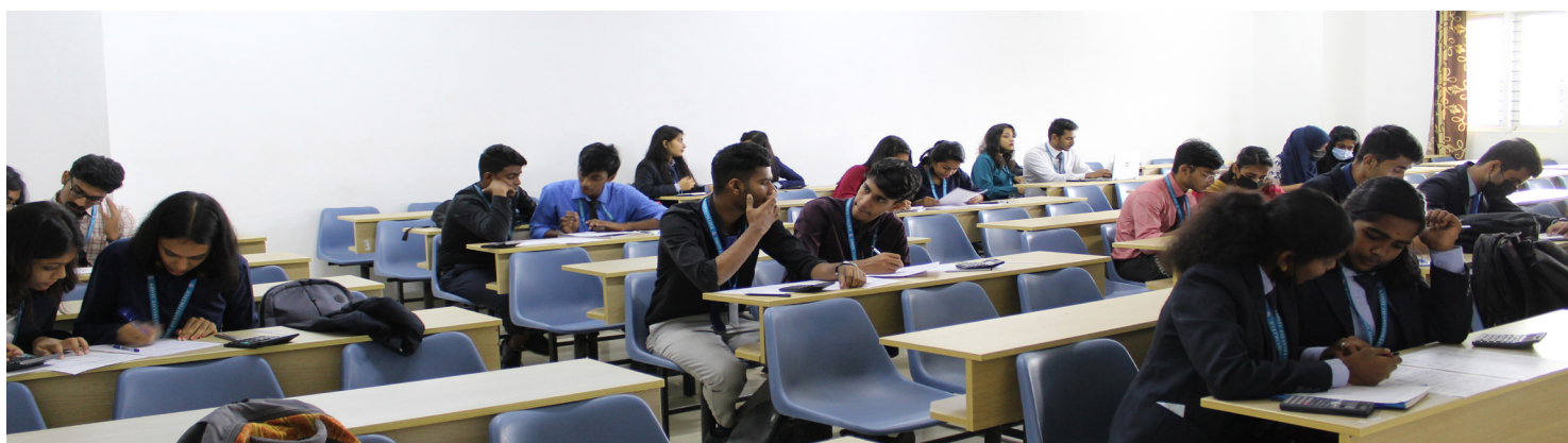
The Dept of Professional Accounting and Finance organized a competition to showcase their skills

The hardwork and dedication the team has shown towards the event is evident from the way the planning and execution is done. Additional events are on queue related to this field. The students and faculty welcomed the smooth sailing fest very well.