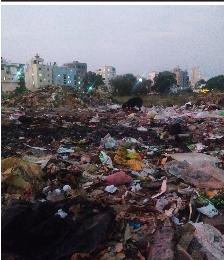
Think before you trash it: Unattended waste near Kothanur

Waste management is a very important step that Bengaluru as a city has to take when the term development comes into play. The people are not taking it seriously and even the government hasn't played any role in helping curb this problem. People are throwing the waste on the roadside pathways and this is directly causing a lot of difficulties to the livelihood around there. In Kothanur, a lot of families and students who are living there are faced by daily issues that arise from the main issue of not having proper waste management systems. People from different places come there and dispose the waste. The students who are walking