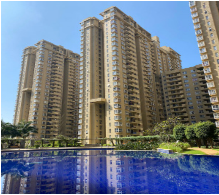
A towering example of economic growth in Bengaluru

Bengaluru is evolving, few years ago, the reputation of the city for being a tech capital appeared to be on the decay. All things considered, India's IT industry is developing at a high speed, and Bengaluru isn't the only place in the country with an abundance of engineering talents. Although in the past years, an ever increasing number of innovative organizations are firing up in the city, and they've been building a-list framework and infrastructure to make Bengaluru more appealing. The outcome is a different city. One that is going to change. At first, the influx of organizations into the city has expanded the quantity of working professional living here. This in turn has encouraged the increase in demand for housing in the city, espe-