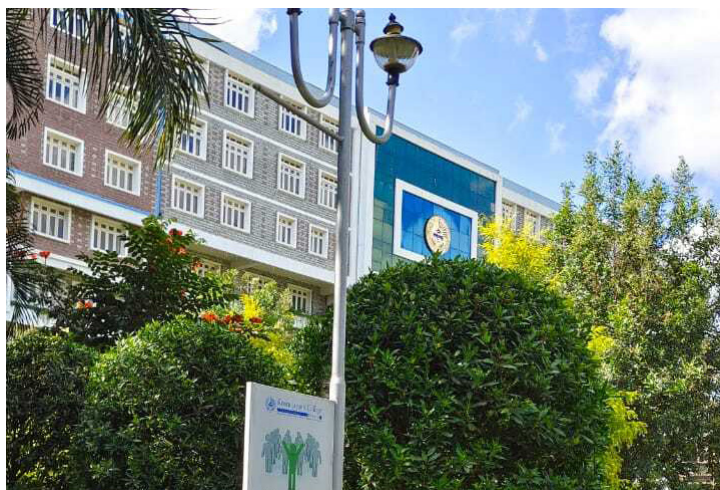
Kristu Jayanti college got A++ by NAAC and awarded clean and green campus by Government of India

National Assessment and Accreditation Council (NAAC) peer team visited Kristu Jayanti college Autonomous on 16th and 17th December in the 3rd cycle of accreditation. The college got accredited as the city's best college with an A++ grade and a cumulative grade point average (CGPA) of 3.78 out of 4. This made Kristu Jayanti College Autonomous as the first in Karnataka and second-best college in India. The college is run by Bodhi Niketan Trust. It accomplished a number of milestones within the short span of time.