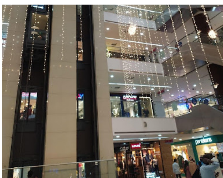
The launch of Lulu-Mall with excitement and glitz

The Lulu Group, based in the United Arab Emirates, launched a new shopping complex in Bengaluru on Monday and plans to develop two additional properties in India in the next six months, indicating that the firm is hopeful about long-term retail growth. M. A. Yusuff Ali, Chairman and Managing Director of Lulu Group, said in an interview with PTI that the company had committed an investment of around Rs 4,500 crore for the development of five