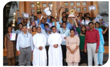
Champions All The Way