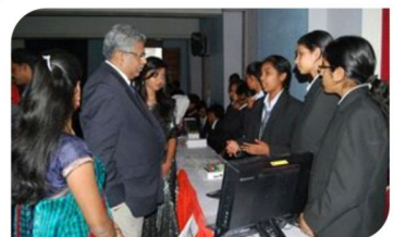
Galaxia Science Exhibition