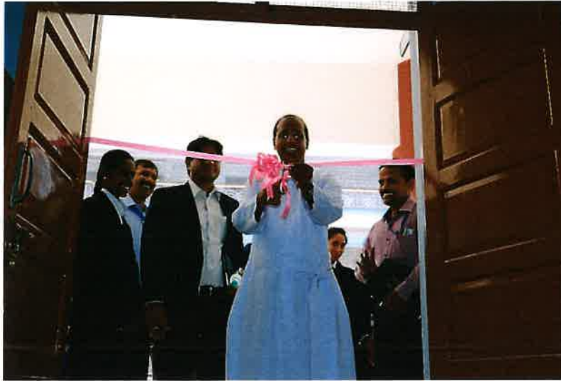
Inauguration by Fr. Principal