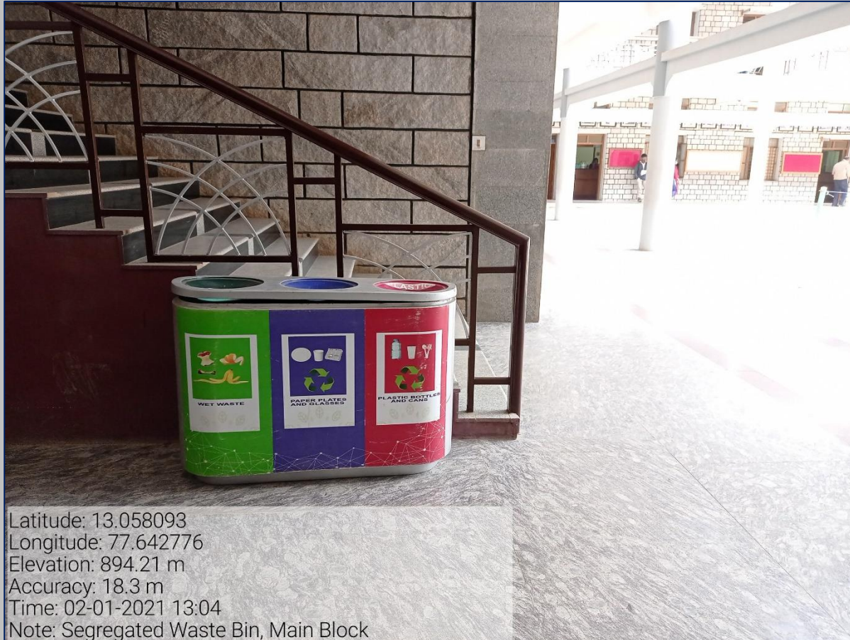
Latitude: 13.058093 Longitude: 77.642776 Elevation: 894.21 m Accuracy: 18.3 m Time: 02-01-2021 13:04 Note: Segregated Waste Bin, Main Block

Reaccredited 'A' Grade by NAAC | Affiliated to Bangalore North University