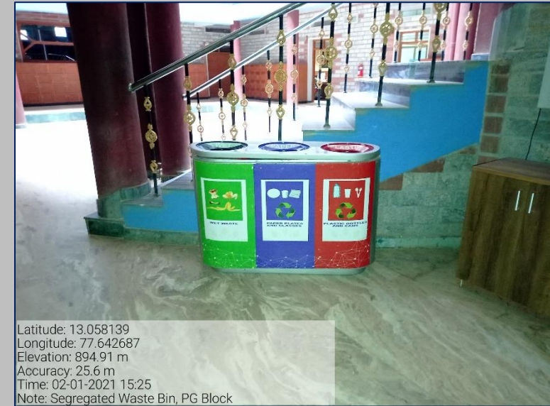
Latitude: 13.058139 Longitude: 77.642687 Elevation: 894.91 m Accuracy: 25.6 m Time: 02-01-2021 15:25 Note: Segregated Waste Bin, PG Block