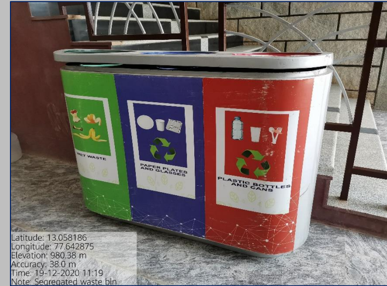
Latitude: 13.058186 Longitude: 77.642875 Elevation: 980.38 m Accuracy: 38.0 m Time: 19-12-2020 11:19 Note: Segregated waste bin