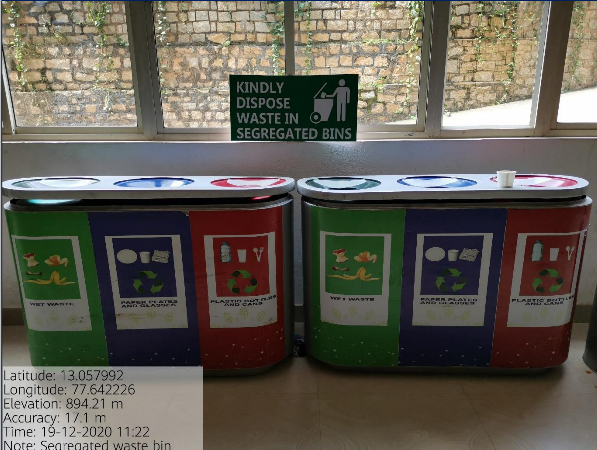
Latitude: 13.057992 Longitude: 77.642226 Elevation: 894.21 m Accuracy: 17.1 m Time: 19-12-2020 11:22 Note: Segregated waste bin