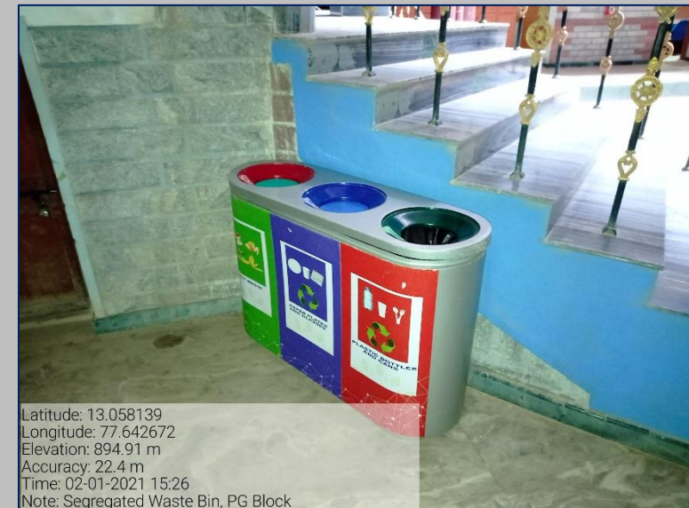
Latitude: 13.058139 Longitude: 77.642672 Elevation: 894.91 m Accuracy: 22.4 m Time: 02-01-2021 15:26 Note: Segregated Waste Bin, PG Block