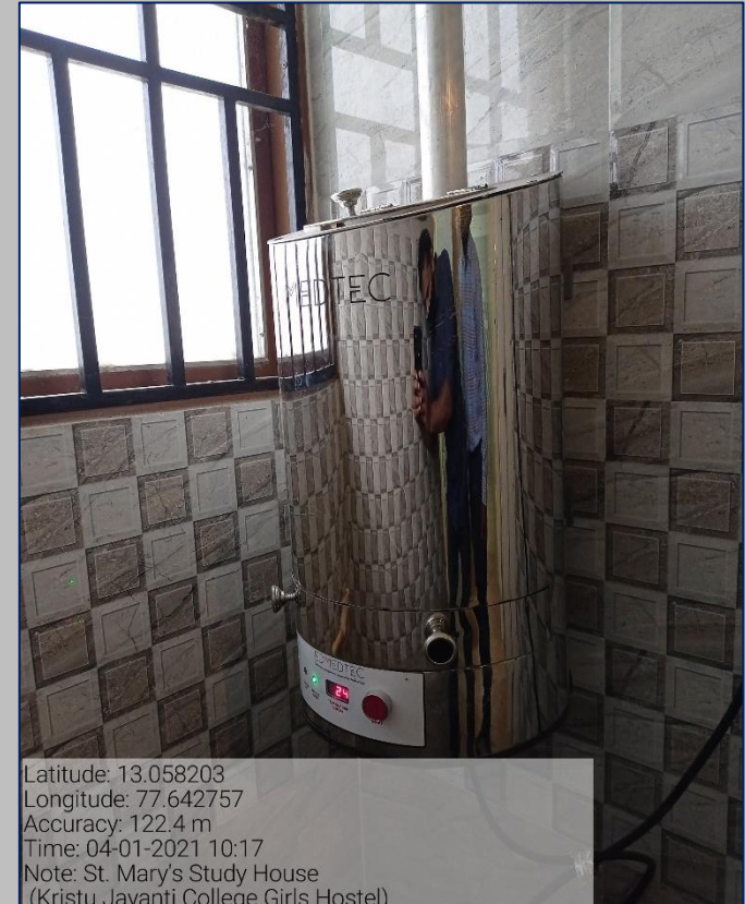
St. Mary's Study House-Girls Hostel

Latitude: 13.058203 Longitude: 77.642757 Accuracy: 122.4 m Time: 04-01-2021 10:17 Note: St. Mary's Study House (Kristu Jayanti College Girls Hostel)