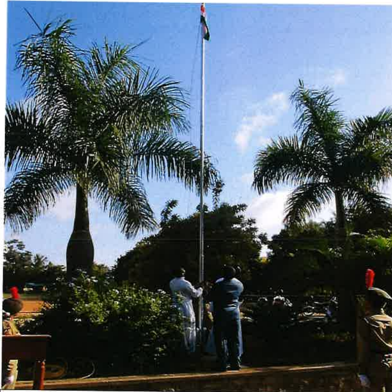
Independence day celebration- 15-08-2015