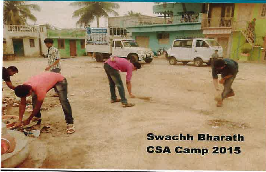
Swachh Bharath CSA Camp 2015