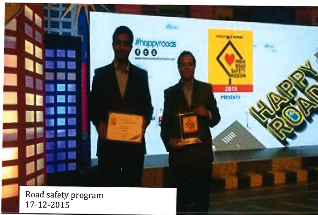
Road safety program 17-12-2015