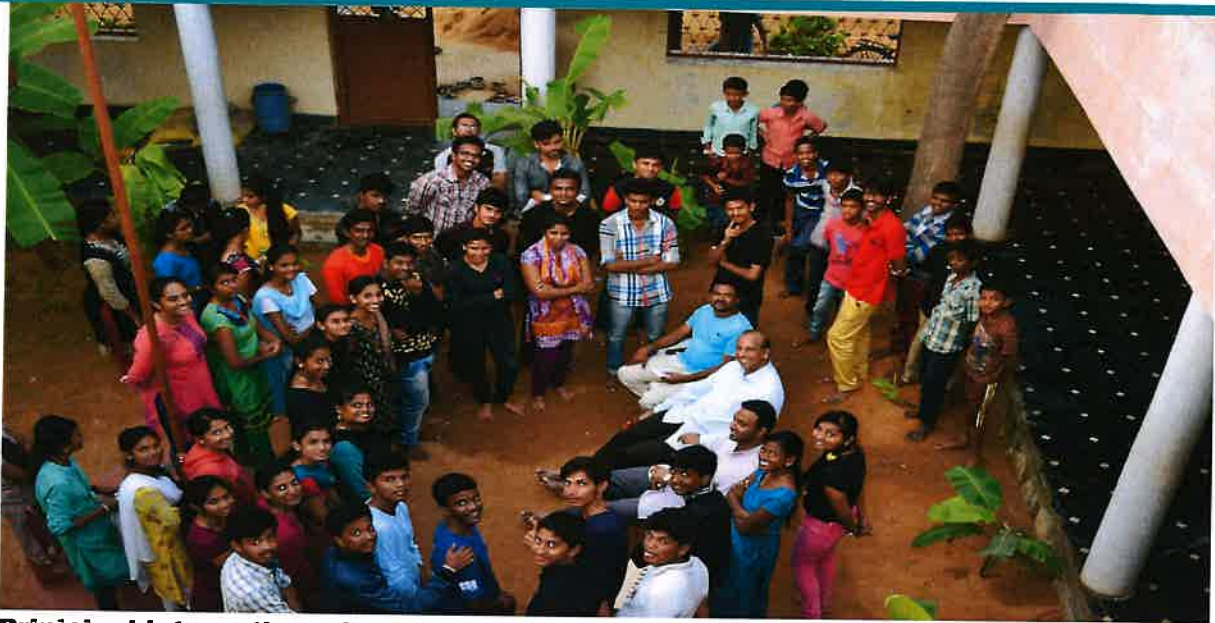
Principal interacting with volunteers in CSA Rural Exposure Camp 2015.