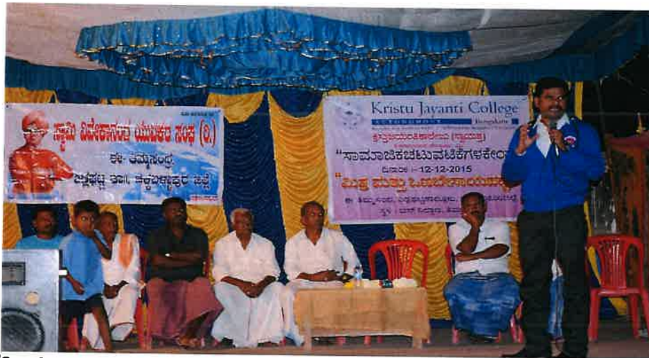
Session on Dry Farm Irrigation CSA Camp 2015