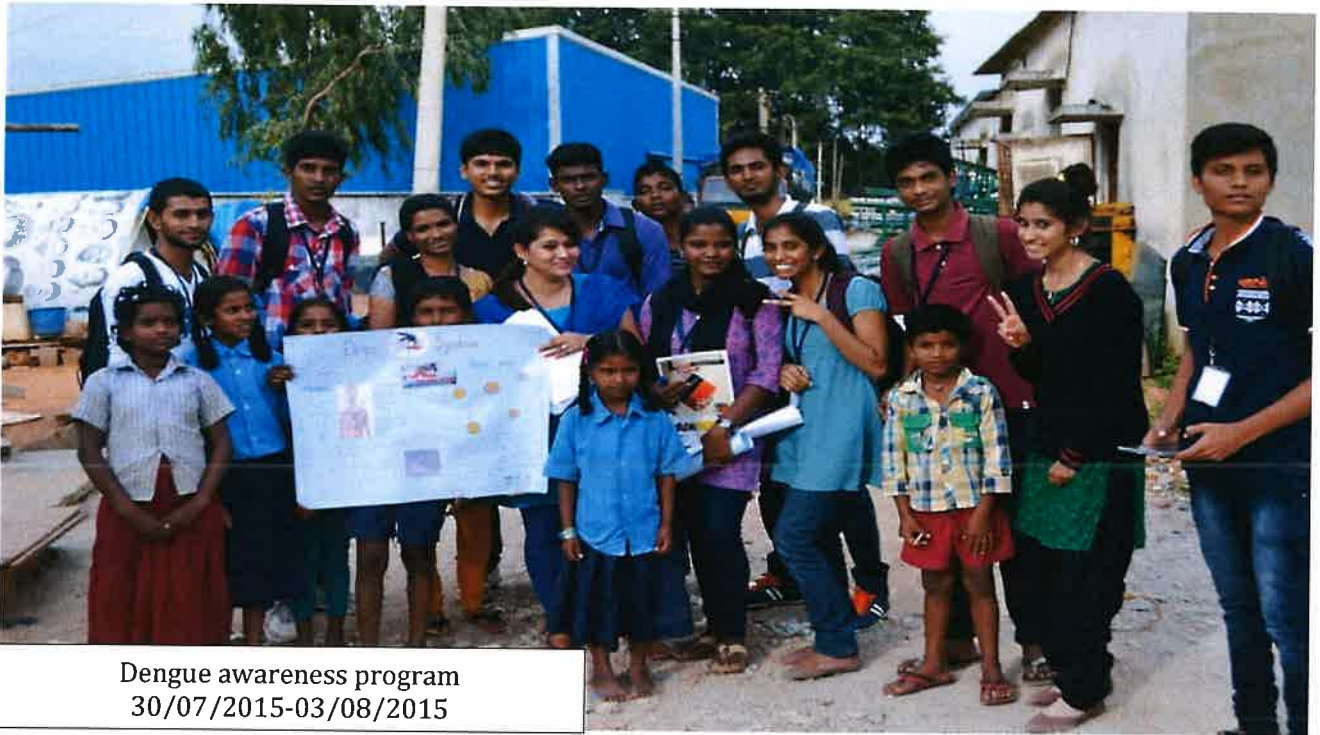
Dengue awareness program 30/07/2015-03/08/2015