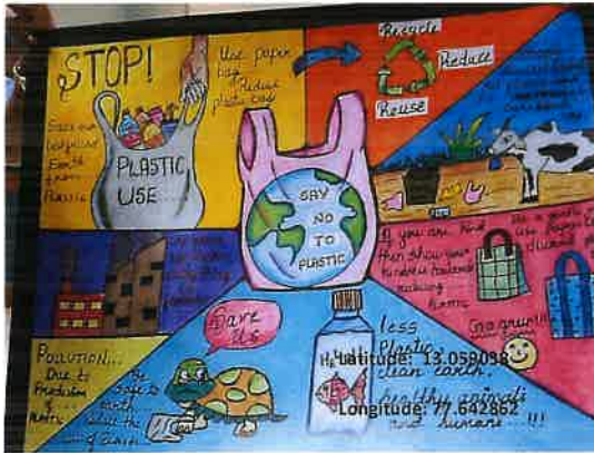
Poster prepared by MCA Student

The participants gained information on the disadvantages of using plastic, their impact on the environment and their safe disposal.