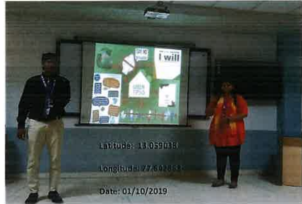
Presentation of the Poster