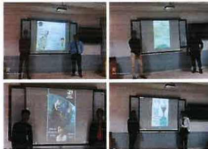
Digital Poster Presentation by Students