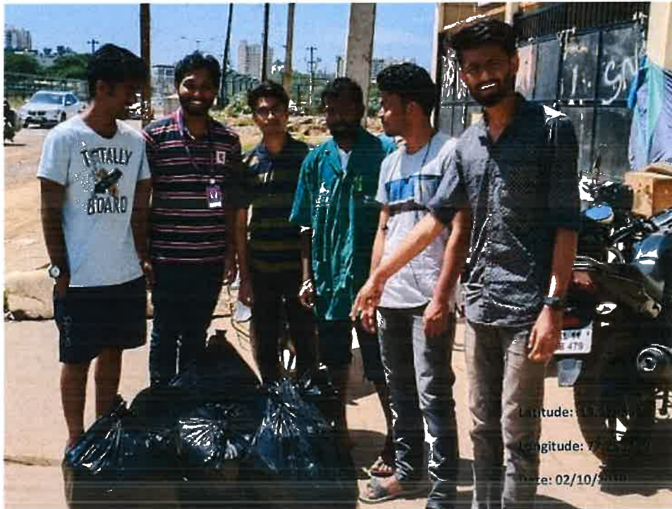
Students depositing Plastic Waste at the collection centre